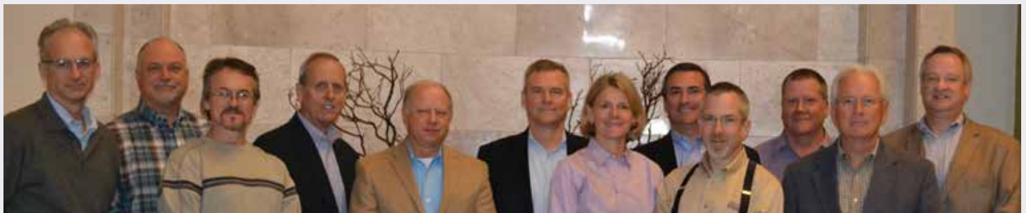
2016 USPOULTRY Foundation Research Advisory Committee