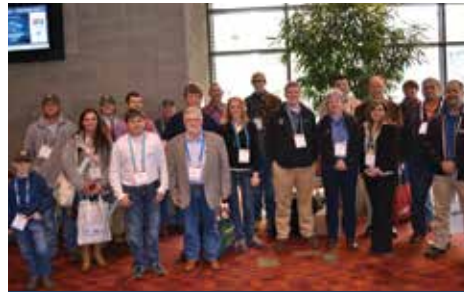
Poultry employees and growers from Keystone Foods take advantage of the free bus service offered during the 2016 IPPE