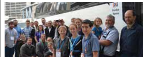
Poultry employees and growers from Peco Foods and Perdue Farms